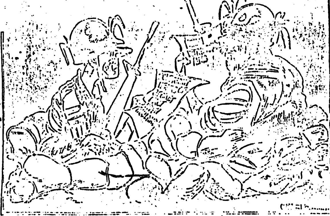
That's how they plan to get us out of Vietnam. They're going to bend us all to Thailand.